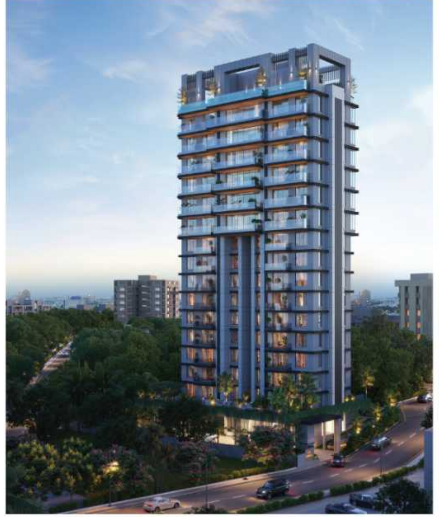
PRANA BY SUPREME PALI HILL - MUMBAI