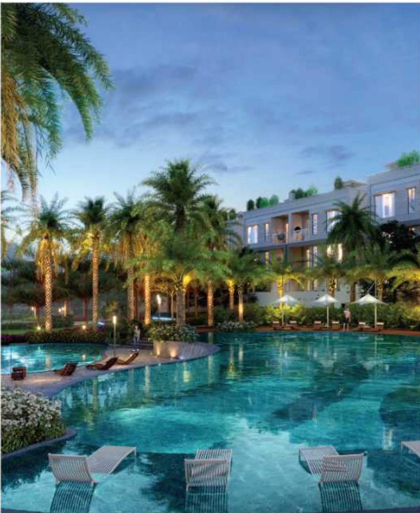
SUPREME VILLAGIO SOMATANE - PUNE