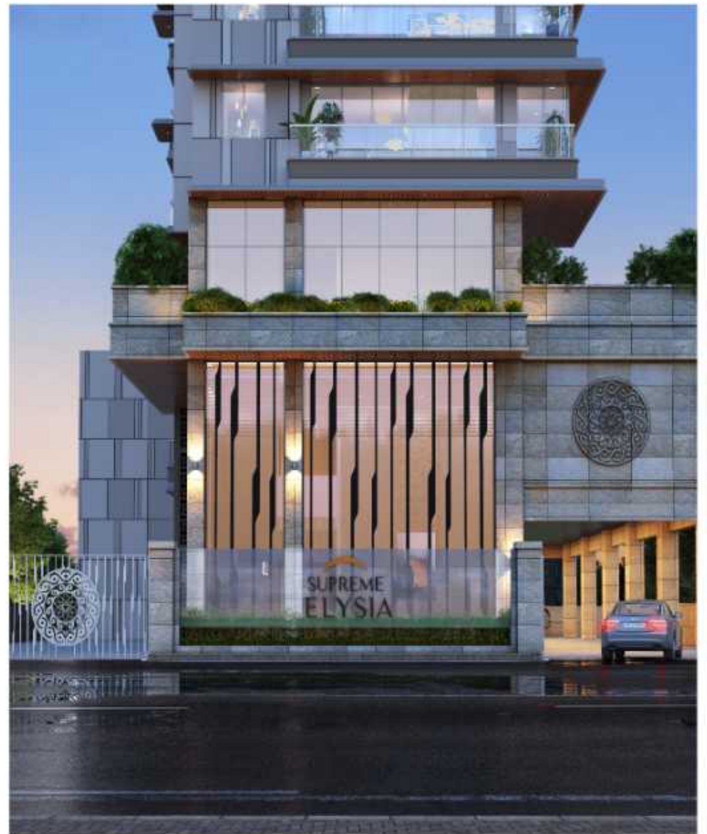
SUPREME ELYSIA SANTACRUZ WEST - MUMBAI