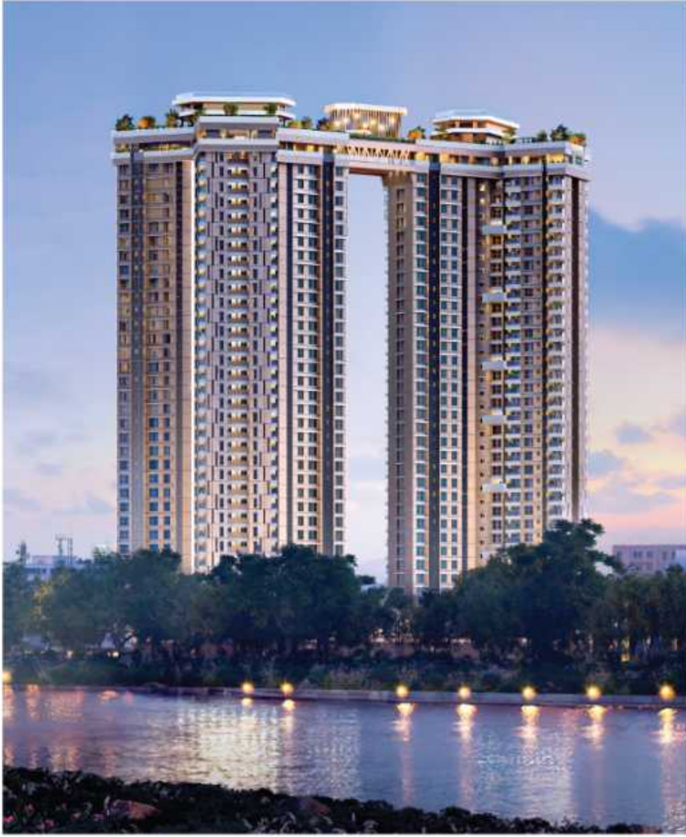
SUPREME TOWERS KOREGAON PARK - PUNE